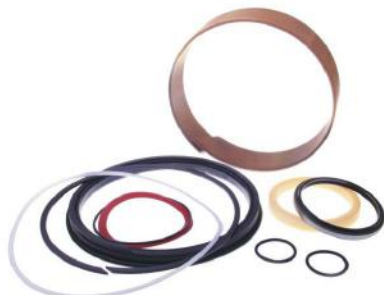
提升油缸油封修理包LIFT CYL SEAL KIT

顾客信誉是企业发展的源泉 Customer credit standing is the source of enterprise development.