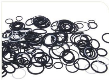
分配阀修理包CONTROL VALVE SEAL KIT