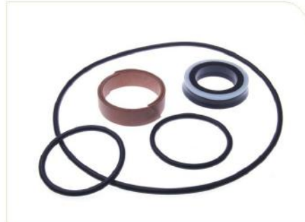
涨紧油缸修理包ADJ SEAL KIT