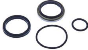
支腿水平缸修理包LEVEL CYL SEAL KIT

顾客信誉是企业发展的源泉 Customer credit standing is the source of enterprise development.