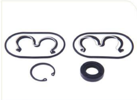
先导泵修理包GEAR PUMP SEAL REPAIR KIT