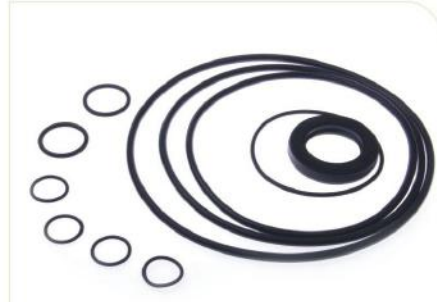
回转马达修理包SWING MOTOR SEAL KIT