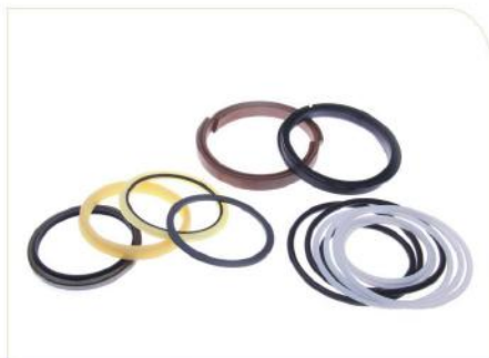
斗臂油缸修理包BUCKET CYL' SEAL KIT