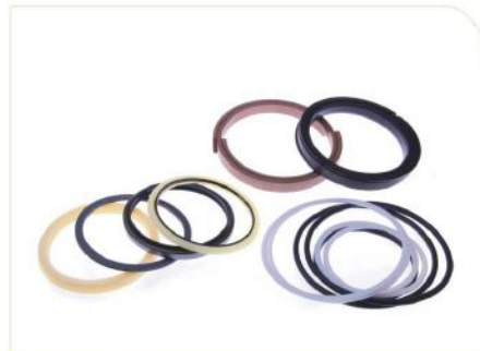
中臂油缸修理包ARM CYL' SEAL KIT