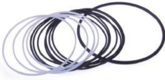
中心回转修理包CENTRE SWING CYL SEAL KIT