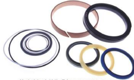
转斗油缸油封修理包DUMP CYL SEAL KIT