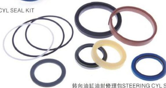
转向油缸油封修理包STEERING CYL SEAL KIT

小松装载机：WA20 WA30 WA40 WA65 WA100 WA120 WA150 WA180 WA200 WA250 WA180 WA200 WA250 WA300 WA320 WA350 WA380 WA400 WA420 WA430 WA450 WA470 WA480 WA500 WA600 WA700 WA800 WA900 WA1200