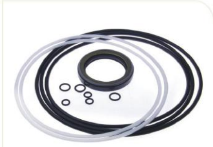
行走马达修理包TRAVEL MOTOR SEAL KIT