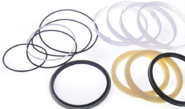
举升缸修理包LIFT SEAL KIT