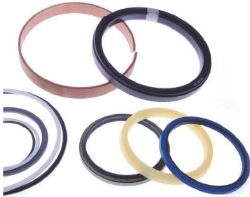
提升油缸油封修理包LIFT CYL SEAL KIT