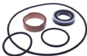
涨紧油缸修理包ADJ SEAL KIT