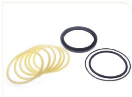
分油中修理包CENTER JOINT SEAL KIT