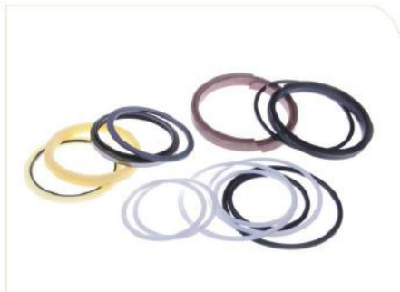
大臂油缸修理包BOOM CYL' SEAL KIT