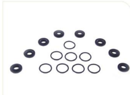
操纵杆修理包PILOT VALVE SEAL KIT