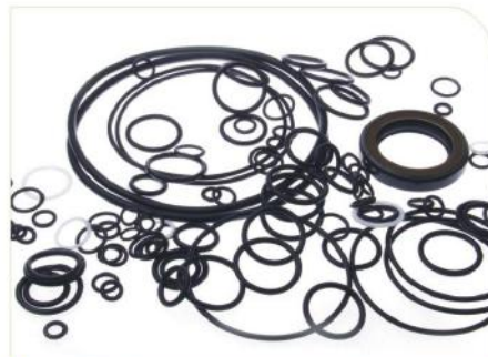
液压泵修理包HYDRAULIC PUMP SEAL KIT