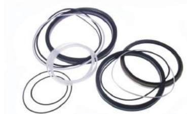
伸缩缸修理包TELESCOPIC CYL SEAL KIT

加滕KATO: NK8A.NK110H.NK160.NK160B-II.NK160E-III. NK200B.NK200E-III.NK250E-III.NK250E-V. NK300.NK300B.NK300E-III. NK400E.NK400E-III NK500.NK500E-III.NK800. NK1200.NK1600.