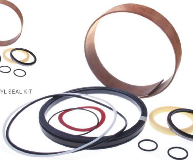
倾斜油缸油封修理包TILT CYL SEAL KIT